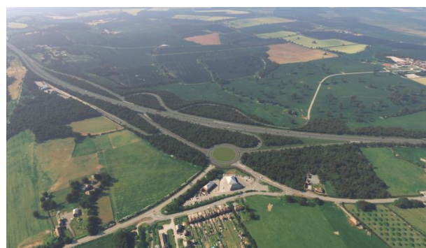
Proposed Hazelgrove junction