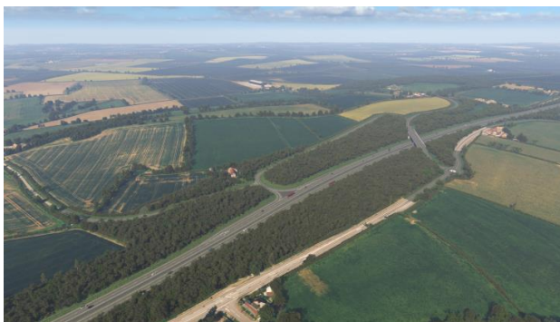
Proposed Downhead junction