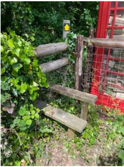
WN19/24 Stile at Hearn Lane Galhampton repaired.