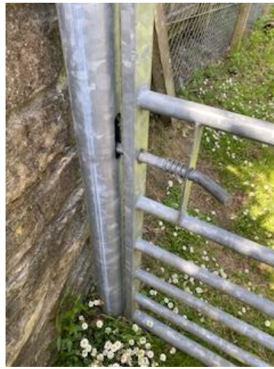
WN19/74 Gate mechanism at Arkle opens easily.