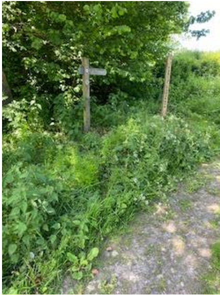
WN19/103 Signpost now standing